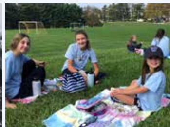
BIG SISTER/LITTLE SISTER