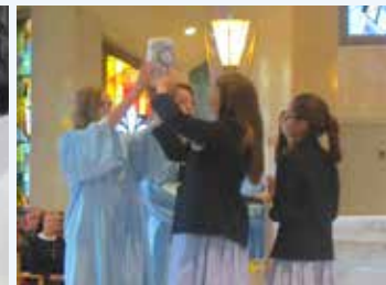
PASSING OF THE LIGHT