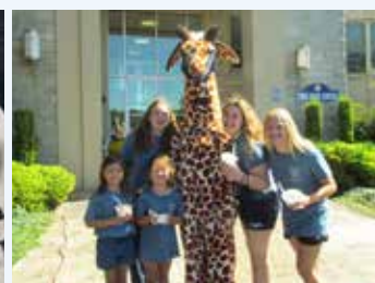
FAMILY MASS AND PICNIC